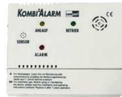
combi sensor anesthesia/ gas detector

The arming LED shows you the switching status of the system at any time. Thus, you know whether the system is armed or disarmed.