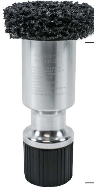
1/2" Drive Socket