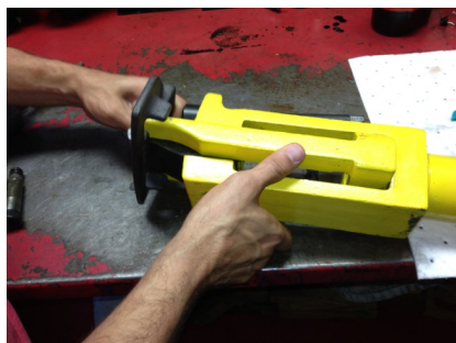
Reinstall hook into tool, keeping plate on the hook.