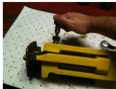
Reinstall set screw and torque to 50 ft lbs.