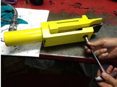
Remove screw set with 3/8 Allen Wrench.