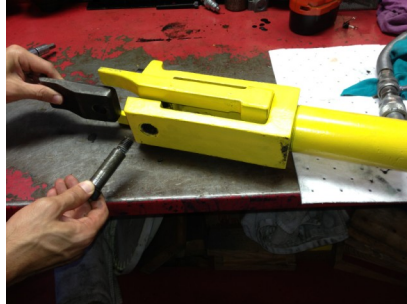
Pull hook from bead breaker.