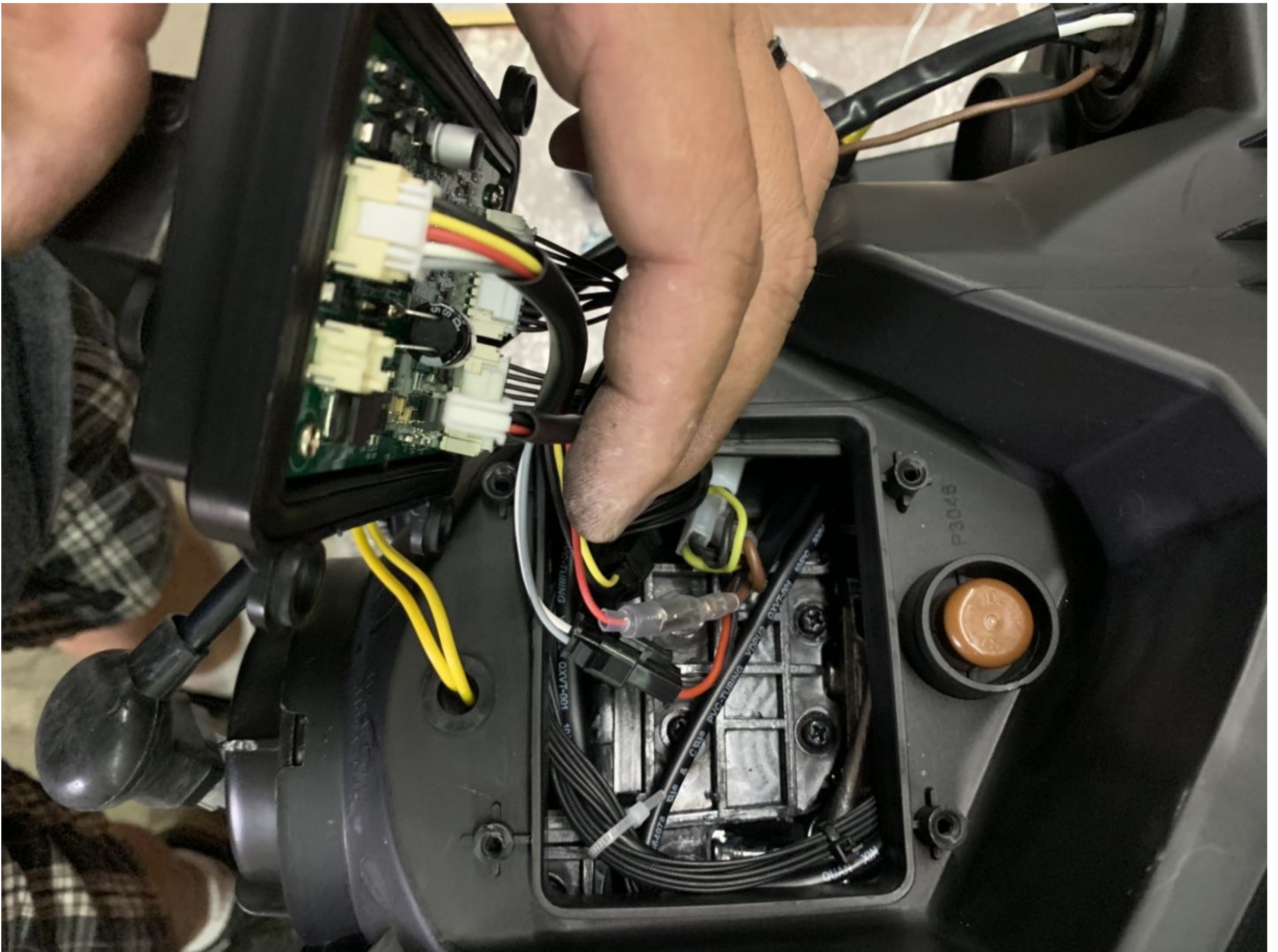
Unplug the 2 pin connector ( red and black wires ) and leave it unplugged