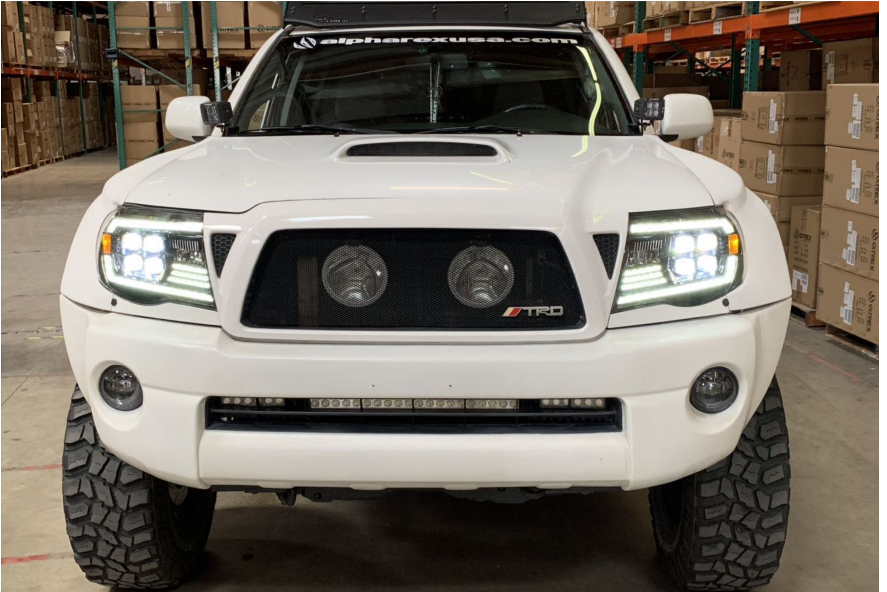
05-11 Toyota Tacoma headlights with 3 LED strips

Our 2005-2011 Toyota Tacoma PRO-Series , LUXX-Series and NOVA-Series headlights come with 3 LED strip on the headlights by default, customers can choose to enable or disable these 3 LED strips based on their preference, and here is the step-by-step instruction.