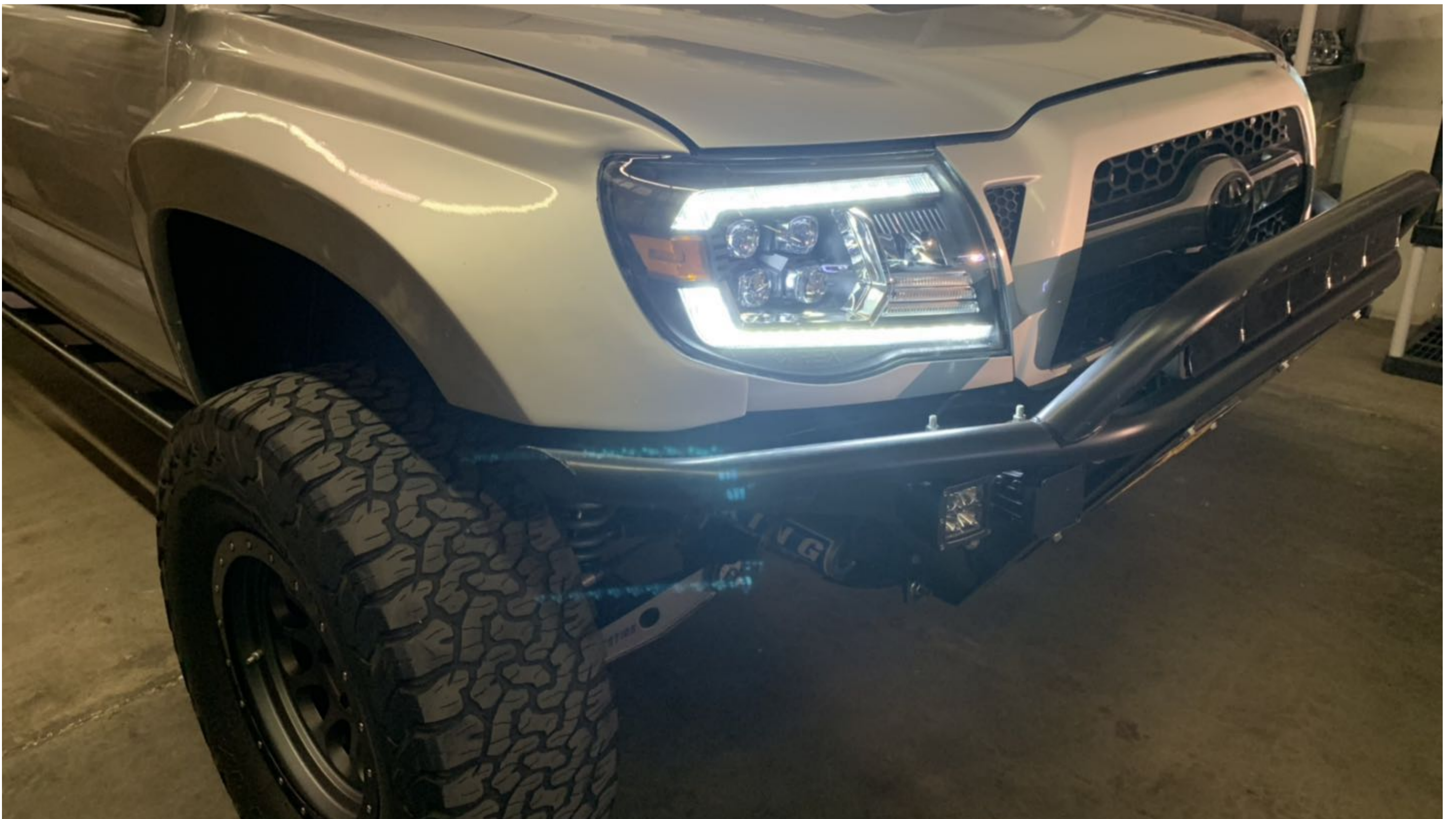
Discover other custom and factory headlights on our website.