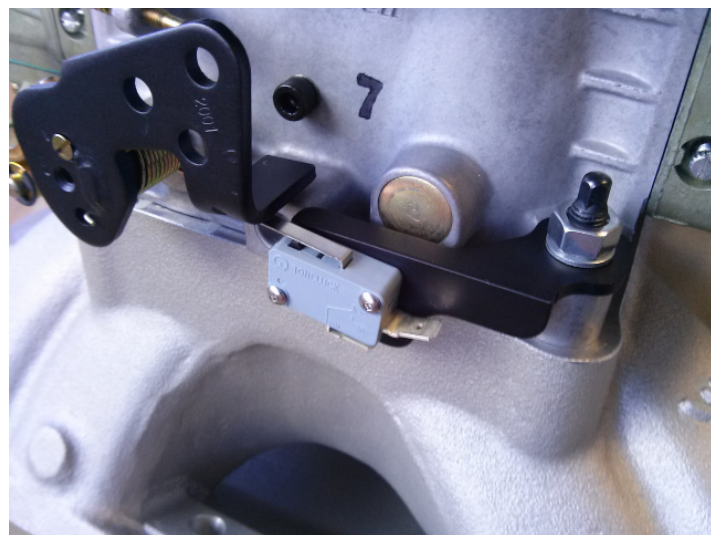
ALL54181 Shown Installed