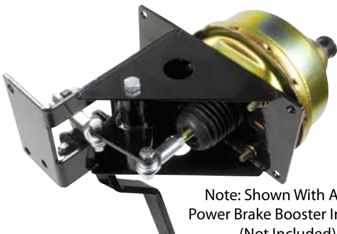
Note: Shown With Allstar Power Brake Booster Installed (Not Included)