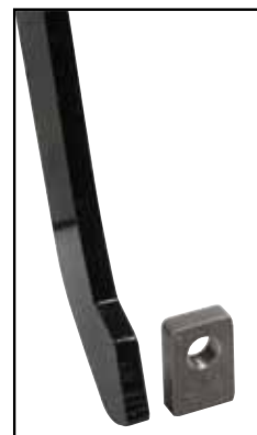
Welding required to mount pedal tab to pedal.