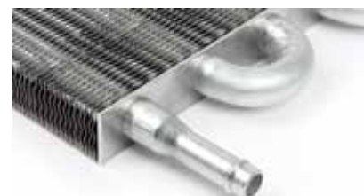
3/8" Barbed Fitting