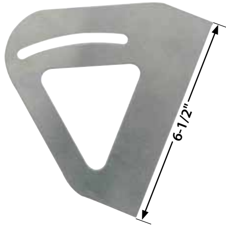
ALL23250 Bracket requires drilling of mounting holes