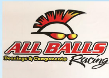
Racing Banner 26" X 30.5" Part#82-4009