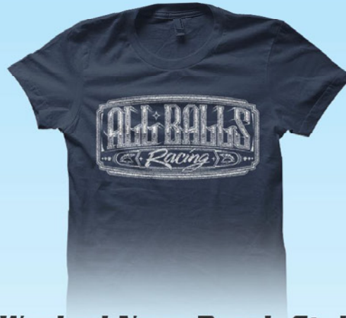
Washed Navy Beach Style