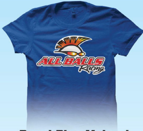
Royal Blue Mohawk