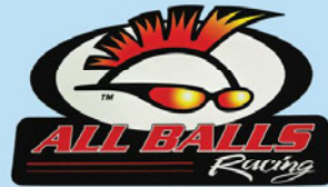
Small Decal Part#82-4011