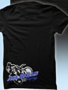
Black/Blue Whip S, M, L, XL Part#82-2001