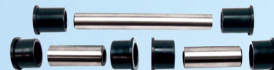
All Balls Upgraded Kit

50-1059 | KVF650, 2006-13 | KVF750, 2005-11