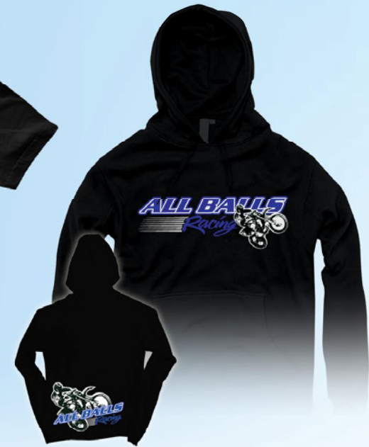
Black/Blue Whip Hoodie S, M, L, XL Part#82-1016