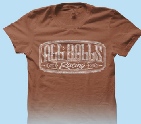
Clay Beach Style