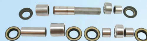
OEM Kit / All Balls Replacement Kit