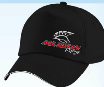
Black & White Cap Adjustable Part#82-2004