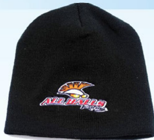
Beanie Hat Part#82-2005