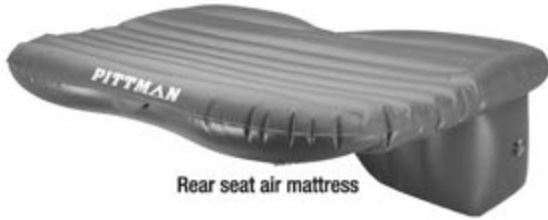
Rear seat air mattress