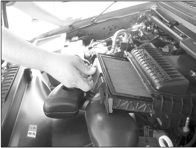
3. Slide the tray with the AIRAID® air filter back into the airbox.