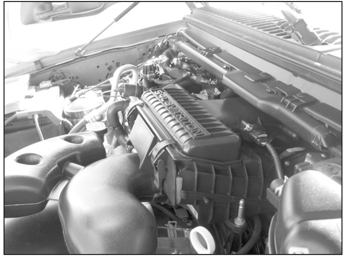
4. Secure the airbox clamps.

For your oiled media filter we suggest using the AIRAID Filter Tune-Up Kit!