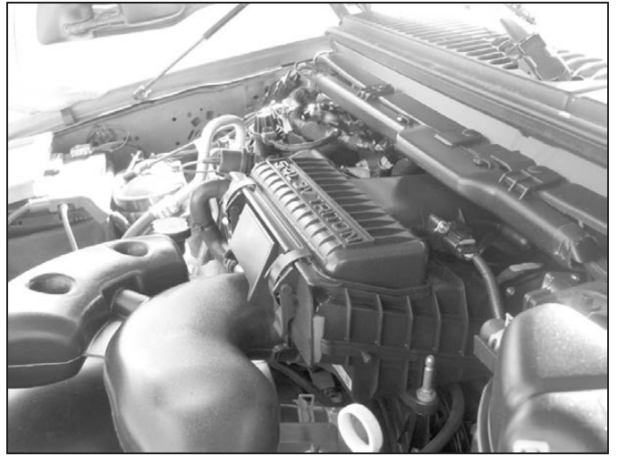
4. Secure the airbox clamps.

For your oiled media filter we suggest using the AIRAID Filter Tune-Up Kit!