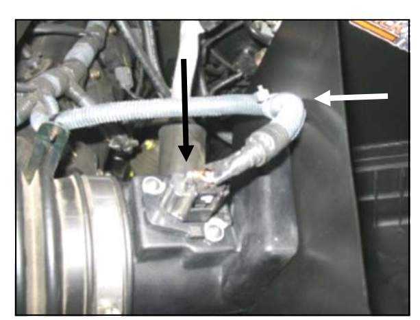
9. Reconnect the MAF sensor wiring harness to the sensor. Mount the factory wiring harness clip into the hole in the Airaid Quick Fit panel.