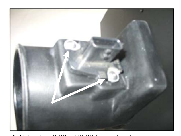
6. Using two 8-32 x \frac{1}{2} " SS button head screws (#11), reinstall the factory MAF sensor into the air filter adapter.