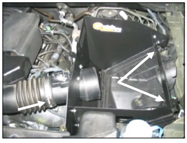
8. Install the Quick Fit Panel assembly onto the factory air box base using the factory clips. Slip the factory intake tube over the air filter adapter, and then tighten the factory hose clamp.