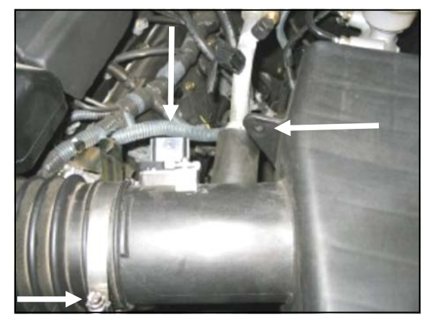
1. <u>Disconnect the negative battery cable.</u> Loosen the hose clamp on the factory intake tube. Disconnect the Mass Air Flow (MAF) sensor wiring harness from the sensor, and unclip the harness from the air box lid.