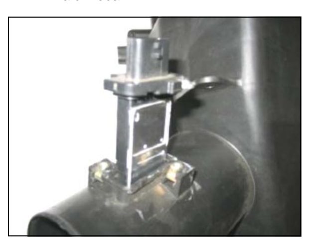
3. Using a Phillips head screwdriver, remove two screws and the MAF sensor from the factory air box lid. Save the sensor for reuse.