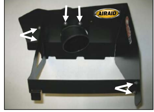
5. Assemble the Airaid Quick Fit Panels (#2, #3) using four 6-32 x 5/16" screws (#6), #6 flat washers (#7), and 6-32 keps nuts (#8). Next, install the air filter adapter (#4) using two \frac{1}{4} -20 x \frac{1}{2} " button head bolts (#9), and \frac{1}{4} " flat washers (#10).