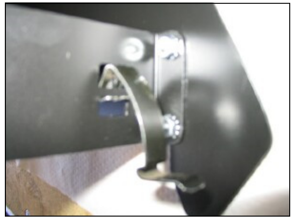
7. Remove the clip from the factory air box lid and install it in the Quick Fit Panels as shown.