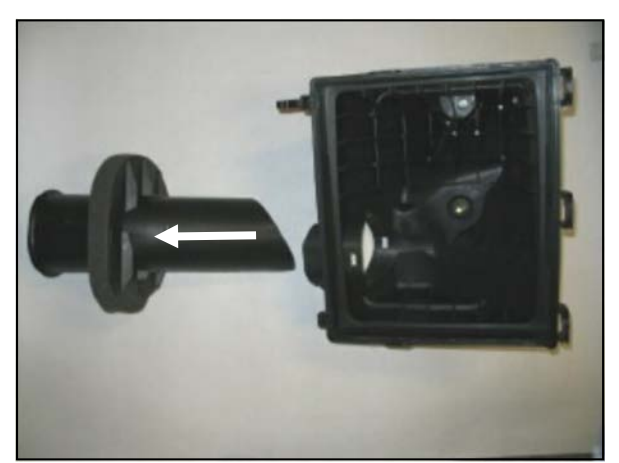
4. Remove the factory air box base from the vehicle. Using a flat blade screwdriver, unsnap and remove the factory tube from inside the air box base. Reinstall the factory air box base and the bolts into the vehicle, without the tube.