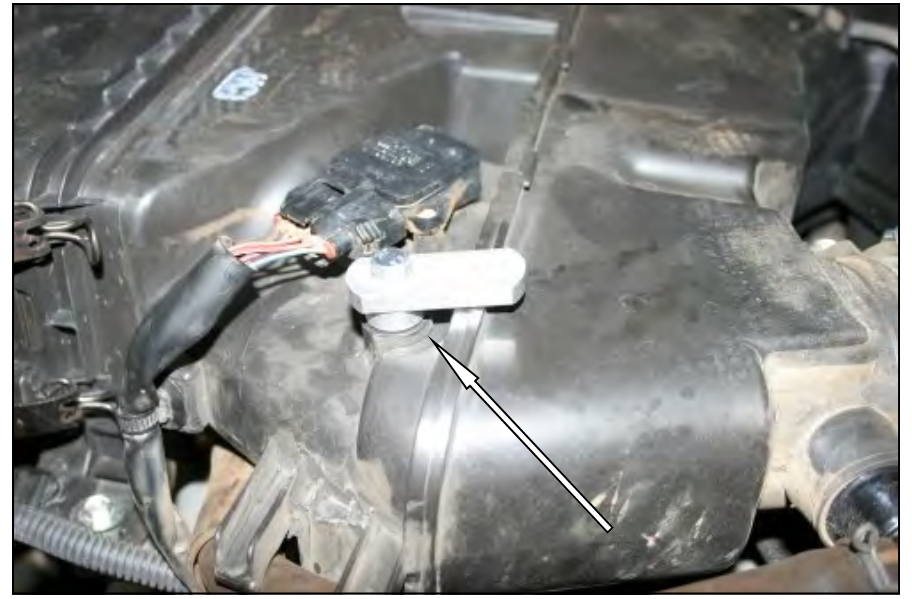
8. Reinstall the resonator/airbox assembly in the reverse order that you removed it using the factory bolts. Make sure to reconnect all breather and vacuum hoses, and the Mass Air sensor electrical connector. Install one 1" extension plate (#9) using the 5/16" thick round spacer (#10) and 6mm x 25mm bolt (#6), with flat washer (#4) in the threaded hole where the stud was removed on the resonator/airbox, with the extension plate facing the throttlebody as shown.