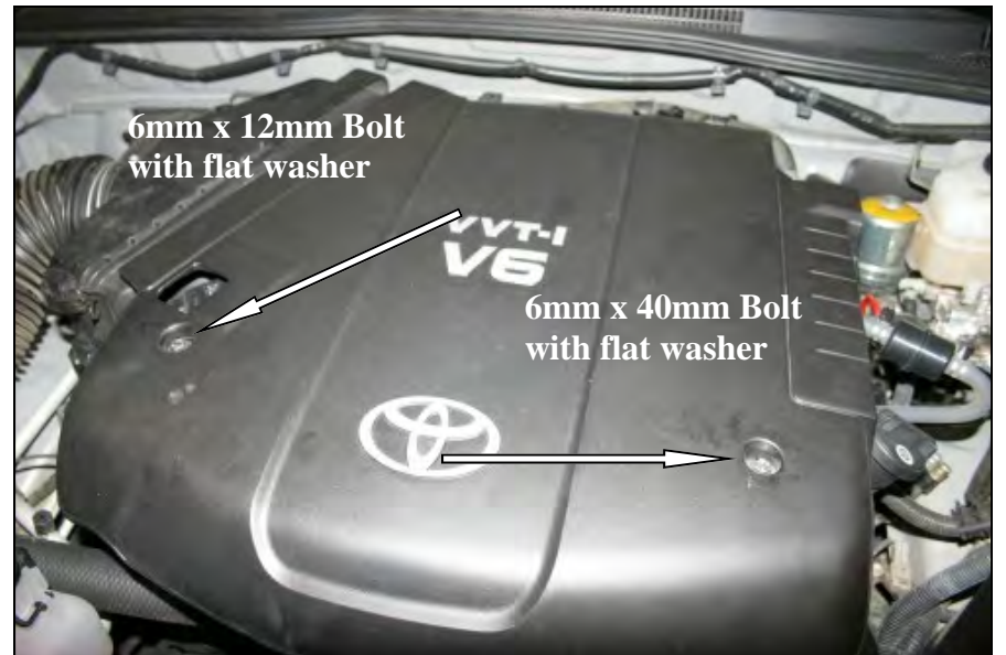
10. Gently reinstall the beauty cover on the engine and use one 6mm x 12mm bolt (#8) with flat washer (#4) on the passenger side, and one 6mm x 40mm bolt (#7) with flat washer (#4) on the driver's side.