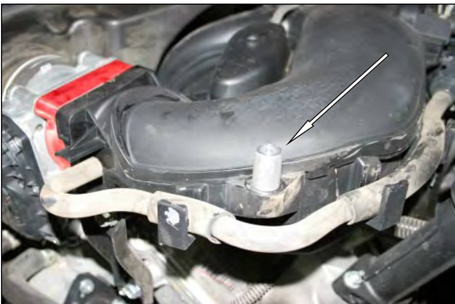
9. Install the 3/4" long round spacer (#11) on top of the threaded hole where the stud was removed on the intake manifold as shown and proceed to the next step.