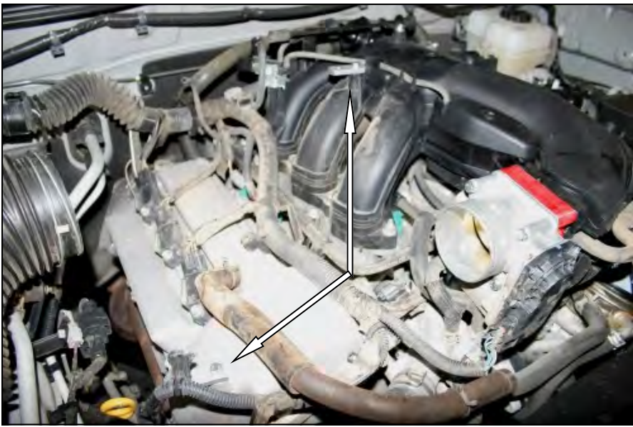
7. Install one 1" extension plate (#9) using a 6mm x 20mm bolt (#5) and flat washer (#4) on the valve cover with the long end of the spacer facing the right fender. Repeat this procedure on the top of the intake manifold at the location shown above.