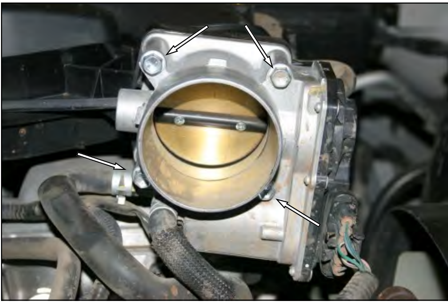
5. Using a 10mm socket, remove the 4 bolts that hold the throttlebody to the intake manifold.