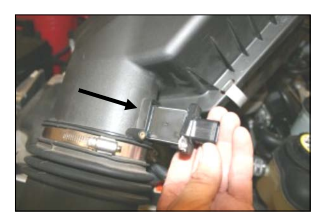
5. Using the provided #20 torx bit, remove two factory screws and the Mass Air Flow sensor from the fac-