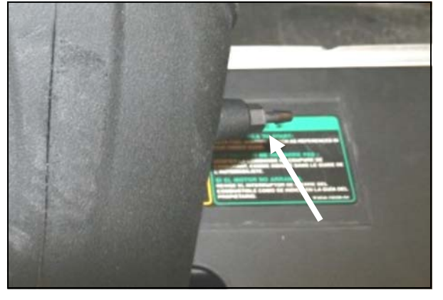
8. Install the 1/8"NPT x 3/16" barbed fitting (#13) into the small threaded hole in the side of the Airaid Intake Tube.

tory airbox lid. Note the direction of the sensor for proper re-installation later. (Save the mass air sensor for re-installation in step #9, the factory screws will not be re-used).