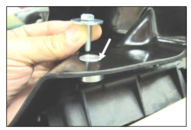
12. Slide the Aluminum Spacer (#12) underneath the CAD and into the hole as shown. Secure the CAD to the inner fender using the OEM bolt from step #1 and the supplied 1/4" Fender Washer (#10).