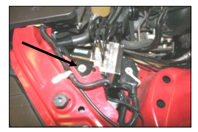
6. Using a 10mm socket, remove and save the bolt from the top of the anti-lock brake bracket. It will be

the holes in the inner fender. They will be used to guide the Airaid Cool Air Dam to the correct location in the vehicle.