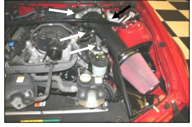
15. Adjust the Airaid Intake Tube for fit and then tighten the hose clamps on the throttlebody and the tube. Now reconnect the wiring harness to the MAF , the breather to the aluminum fitting, and the vacuum hose to the barbed fitting on the Airaid Intake Tube.