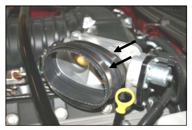
10. Install the oval hump hose (#4) onto the throttle body with two provided #80 hose clamps (#9). Leave the clamps lose for now.