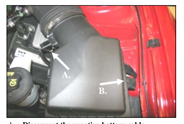
1. Disconnect the negative battery cable. A.) Slide out the RED locking tab on the bottom of the Mass Air Flow sensor (MAF) connector, and then squeeze the BLACK tab and disconnect the connector from the sensor. B.) Using a 10mm socket, remove and save the bolt that holds the air filter box to the inner fender. It will be reinstalled in step #13.