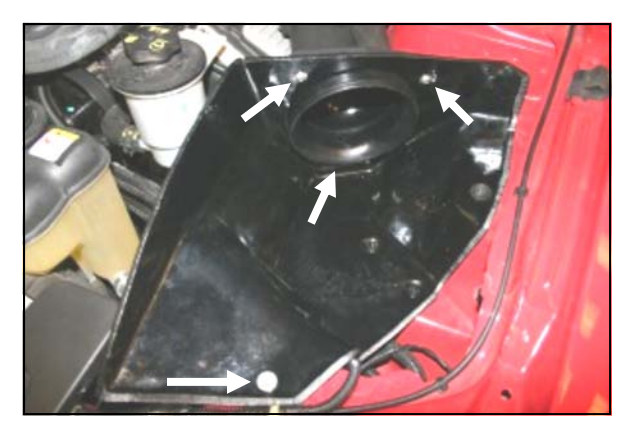
13. Install the Cool Air Dam into the vehicle aligning the grommet posts on the bottom of the CAD into the factory grommets in the fender well. Now install three 1/4" button head bolts (#6) and flat washers (#7) thru the CAD and into the Airaid Intake Tube. Next reinstall the second factory bolt from step step #6 into it's respective hole.