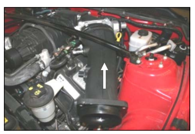
11. Install the Airaid Intake Tube into the oval hump hose. For ease of installation, don't tighten the clamps yet!