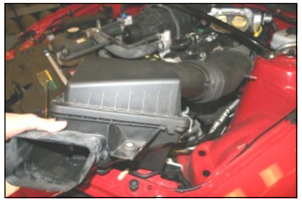
3. Remove the complete factory intake system from the vehicle.