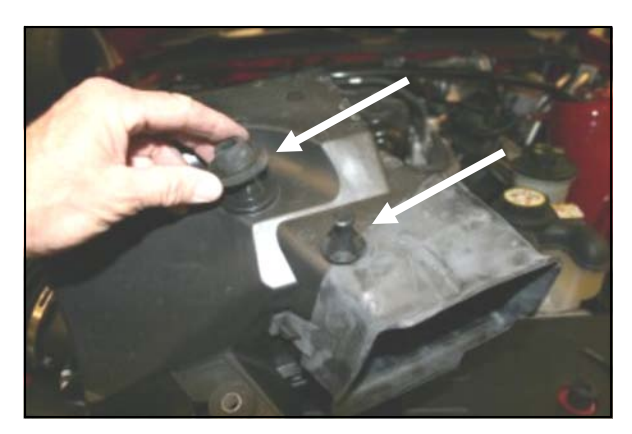
4. Remove the two factory grommets from the bottom of the factory airbox and replace them back into