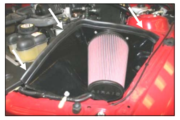
14. Install the Airaid Premium Filter (#1) onto the Airaid Intake Tube and tighten the hose clamp. Next install the supplied weather strip (#5) onto the top of the CAD as shown. For ease of installation, start next to the radiator and work your way towards the fender.

Make sure there is no foreign material in the intake path. Make sure all clamps, hoses, bolts, and screws are tight. Double check the hood clearance!