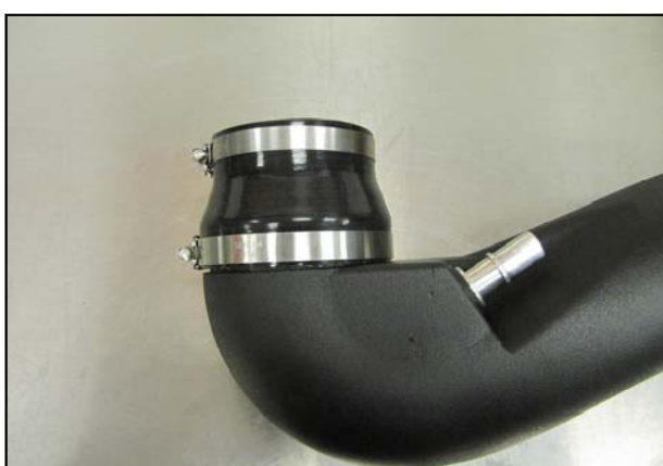
8. Install the Silicone Reducer (#4) and Hose clamps (#9) onto the Airaid Intake Tube. Place the #56 Clamp (#18) on the throttle body side of the Reducer, and the #64 Clamp (#9) on to the Tube side.