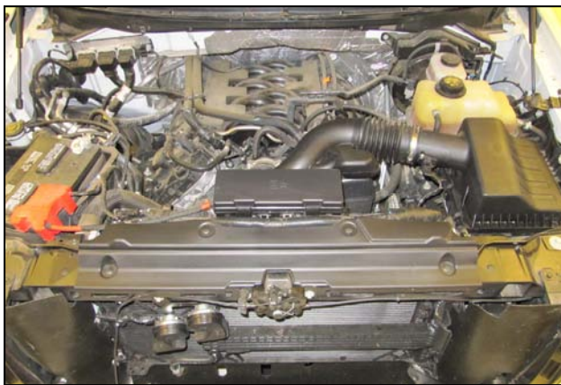
1. Disconnect The Negative Battery Terminal!

* Filter included in Airaid Jr. kit only