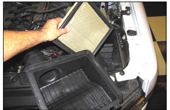
3. If installing the Airaid Jr. Kit, unfasten the three clips on the left side of the factory airbox, and remove the upper half of the factory airbox. Remove the factory air filter element.