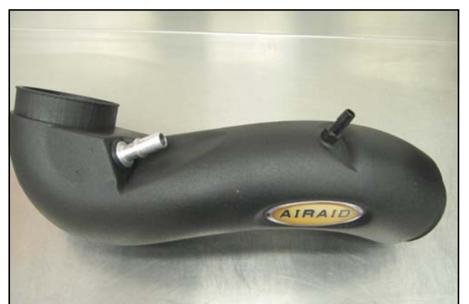
6. A.) Install the 3/8 " Barbed Fitting (#5) into the threaded hole in the Intake Tube. B.) Insert the 5/8" Grommet (#7) into the Intake tube as shown. Complete the tube assembly by inserting the 5/8 PCV Fitting (#6) into the Grommet. Apply the Airaid Bubble Decal onto the Intake Tube as shown.