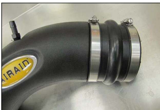
7. Install the hump hose (#3) and two #60 hose clamps (#9) onto the Intake Tube as shown. Leave the hose Clamps loose for now.