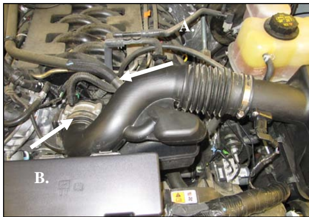
2. A. Disconnect the two breather lines in the factory intake tube . B. Loosen the two intake clamps, and remove the factory intake tube.