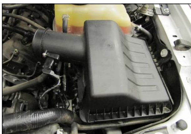
5. Reinstall the airbox upper half.