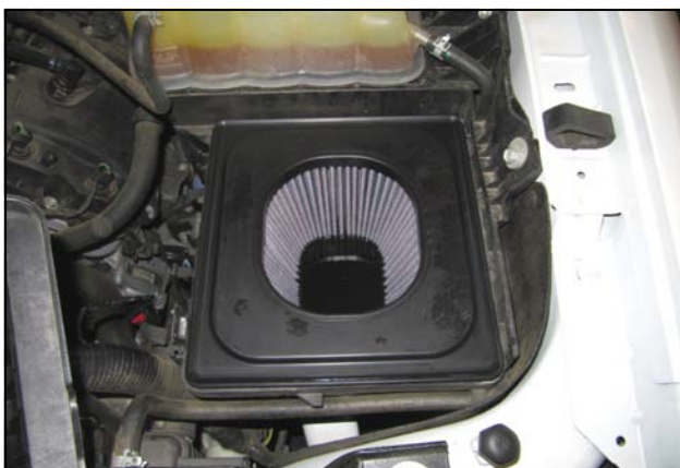
4. Install The Airaid Premium Filter (#1) into the air-box.