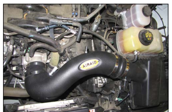
9. Install the Intake Tube onto the throttle body first, then into the airbox. Tighten all of the Hose Clamps.