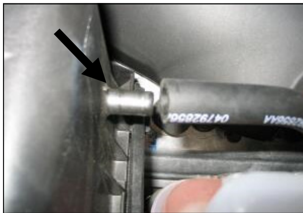
2. Disconnect the breather hose from the factory air box lid.