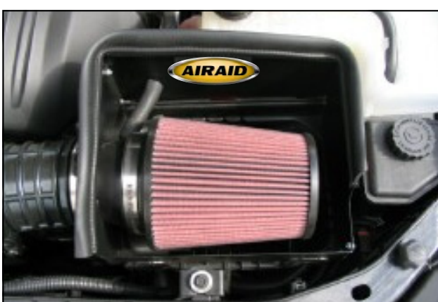
7. Install Airaid filter on the end of the intake tube. Install weather strip on CAD. ( Note: Start from one end of air box and work your way to the other end. )