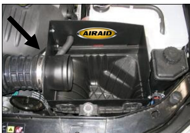
5. Install the Airaid CAD in place of the factory air box lid. Tighten factory hose clamp. Apply the Airaid Foil Decal onto the Panel as shown.