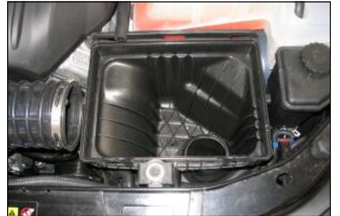
3. Remove the factory air box lid and flat panel filter. ( Note: Retain the factory air box base. )