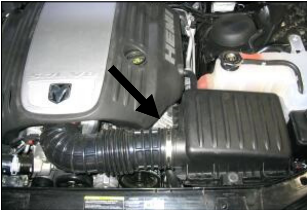
1. Loosen the hose clamp on the intake tube.