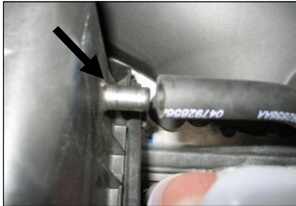
2. Disconnect the breather hose from the factory air box lid.