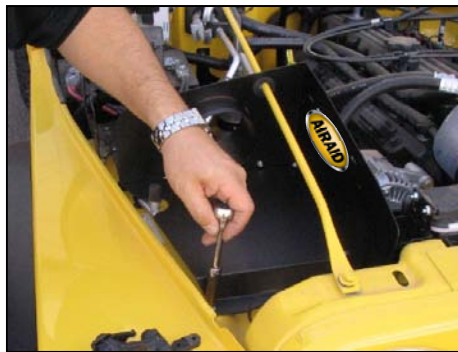
14. Using the supplied 1/4 x 20 nut, bolt and washers, mount the front of the Airaid Cool Air Dam to the inner fender.