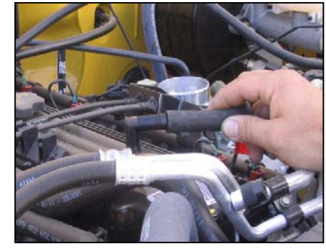
19. Install the supplied rubber hose on the factory plastic valve cover breather fitting.