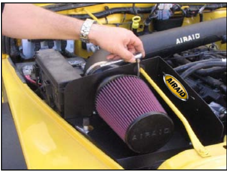
27. Install the Airaid Premium Filter on the Cool Air Dam assembly. Secure the filter using the supplied hose clamp.