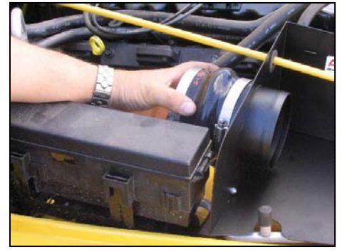
20. Install the urethane hump hose and two #72 hose clamps on end of the Airaid Cool Air Dam. Leave hose clamps loose until final assembly.