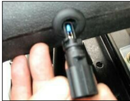
18. For 2005-06 Vehicles: Install the supplied rubber grommet with the hole. Next, install the factory air temp sensor retained from step 3 into the grommet.