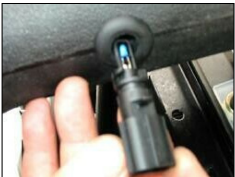
25. For 2005-06 Vehicles: Re-connect the air temp sensor on the backside of intake tube.