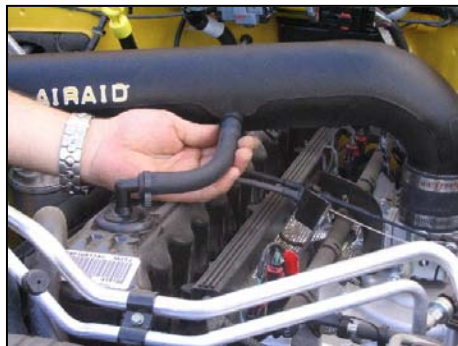
26. Connect the other end of the valve cover hose to the intake tube. Secure both ends of the hose using the supplied black speed clamps.