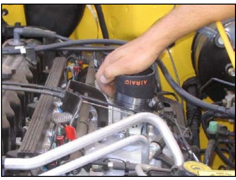
21. Install reducer coupler on throttle body with two #44 hose clamps. Leave hose clamps loose until final assembly.