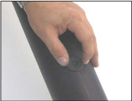
17. For 1997-2004 Vehicles Only: Install the supplied rubber grommet with out the hole into the Airaid intake tube.