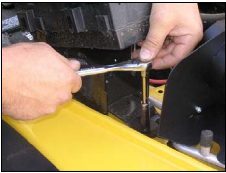
13. Align the mounting holes in the Airaid Cool Air Dam with the factory holes in the inner fender. Using the original bolts from step 7, mount the Airaid Cool Air Dam to the inner fender.