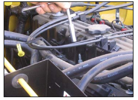
16. Remove one valve cover bolt on the passenger side nearest to the oil fill cap. Use this bolt to mount the supplied mounting bracket to the engine as shown above. Leave bolt loose until final assembly