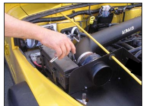
24. Make final adjustments to the intake tube for correct position. Tighten all four hose clamps and bracket.