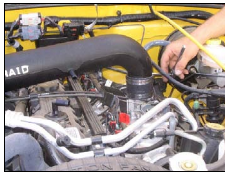
22. Install Airaid intake tube by connecting both ends into the urethane hump hose and reducer.