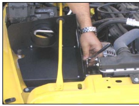
15. Using the original bolt from step 5, mount the Airaid Cool Air Dam to the passenger side radiator mount.