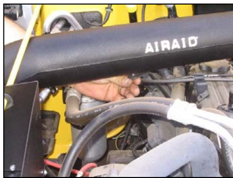
23. Mount the Airaid intake tube to the valve cover bracket using the supplied 1/4" bolt and washer as shown above.