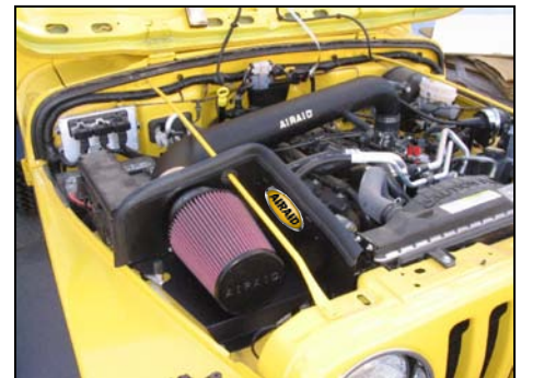
28. Install the weather strip on the edge of the Cool Air Dam assembly as shown above. Reconnect negative battery cable. Double-check your work to be certain that all nuts, bolts, and clamps are securely fastened.

Thank you for purchasing the Airaid Intake System. Your Airaid Intake System was carefully inspected and packaged. Check that no parts are missing, or were damaged during shipping. If any parts are missing, contact Airaid. The air filter element is protected from direct exposure to water and debris; care should be taken not to drive through deep water. WATER INGESTION IS THE DRIVERS RESPONSIBILITY! The air filter is reusable and should be cleaned periodically.