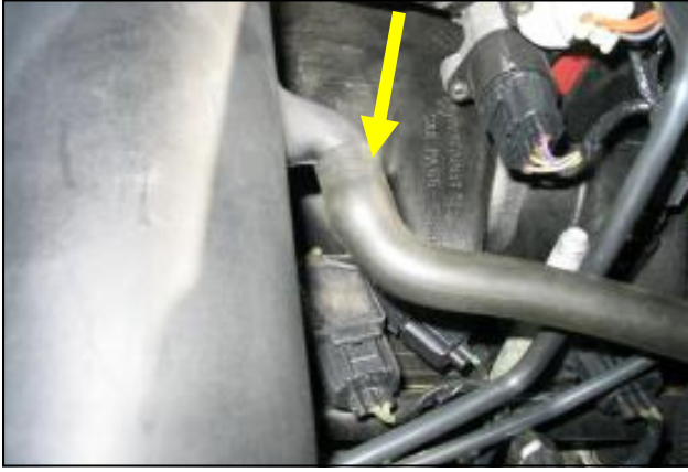
10. Connect the factory breather hose to the Modular Intake Tube & secure hose with the #16 black speed clamp provided.