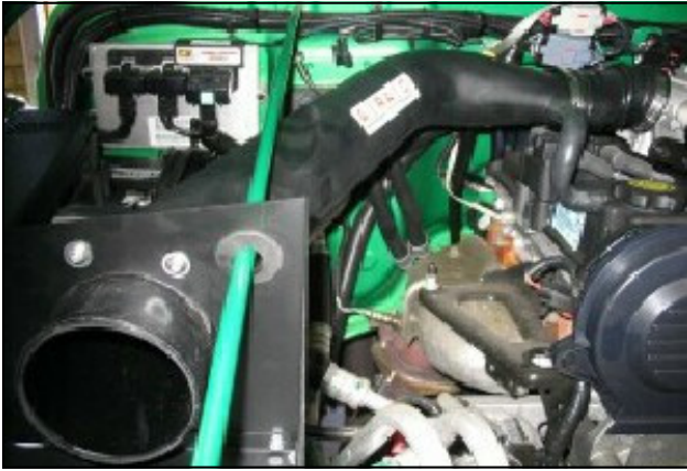
13. Install factory throttle body coupler on end of Airaid intake tube and position assembly on engine as shown. Mount Airaid intake tube to Cool Air Dam using two supplied 1/4"-20 bolts and washers provided. Connect factory breather hose to Airaid intake tube.