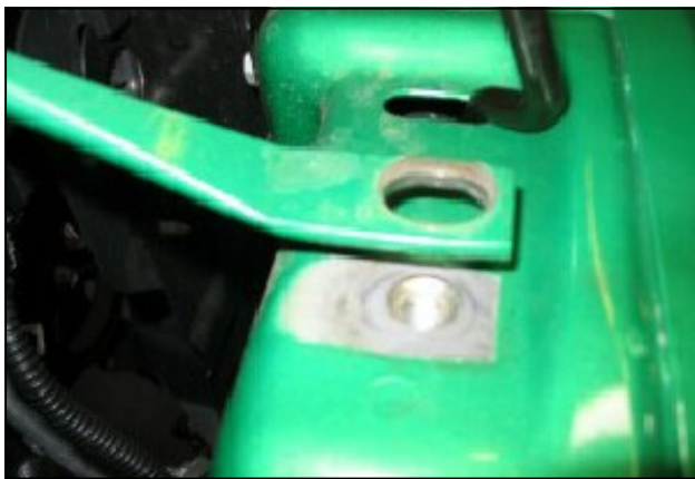
1. Disconnect the negative battery cable. Remove bolt for radiator support rod. (Note: Retain bolt for later use.)