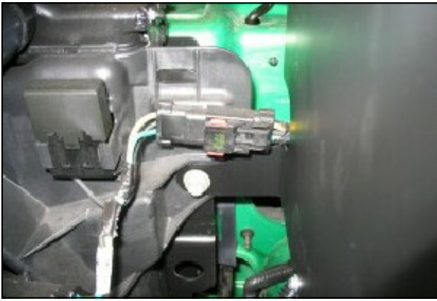
10. Using a 7/16" socket, reinstall the original bolt through the Airaid Cool Air Dam and radiator fan cover.