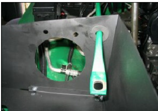
8. Position Airaid Cool Air Dam in place by inserting factory radiator support rod through grommet as shown.