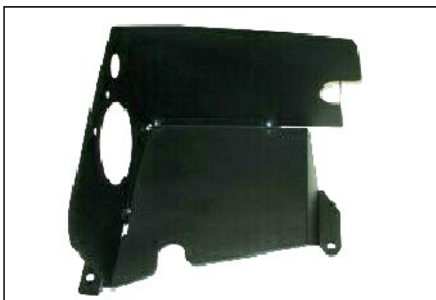
7. Using the supplied hardware, assemble the two Airaid panels as shown.