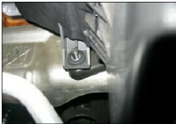
2. Loosen hose clamp attaching air filter assembly to throttle body. Using a 1/2" socket, remove bolt on back side of air filter assembly.