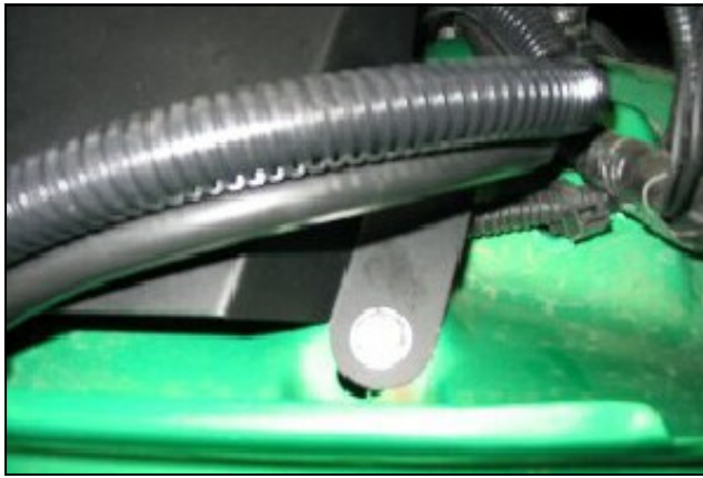
11. Using the supplied hardware and 7/16" socket, fasten the front of the Airaid Cool Air Dam to the fender.