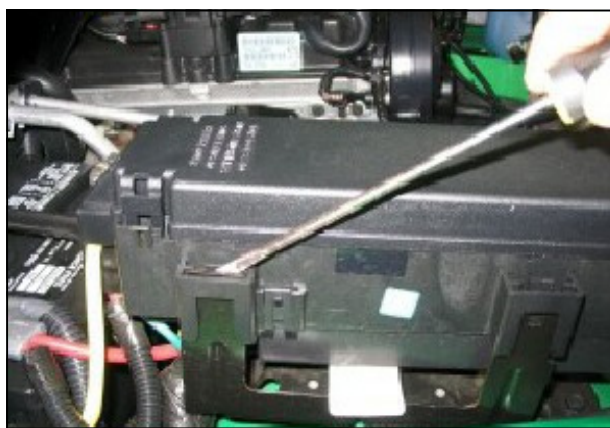
5. Using a flat blade screwdriver, unclip the fuse box from the bracket and set aside. Using 10mm socket, remove bolt from bracket. (Note: Retain bolt for later use.)