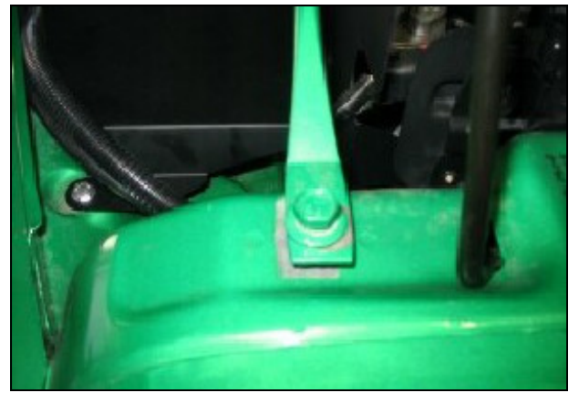
12. Using a 1/2" socket, reinstall the original bolt on the radiator support rod.