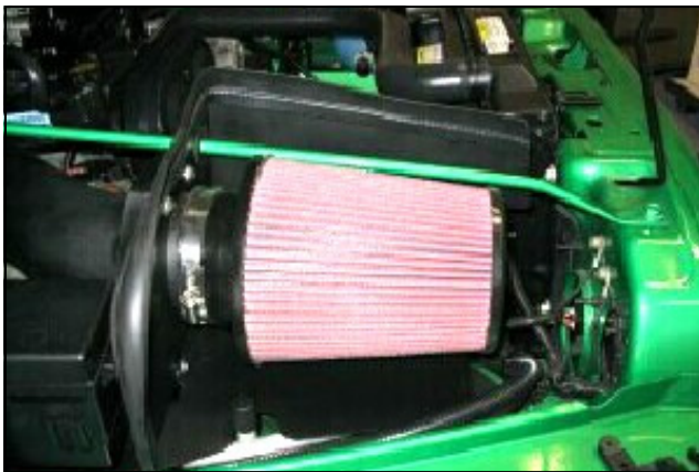
14. Install the Airaid filter on the end of the intake tube. Install the weather strip on the top edge of the Cool Air Dam. (Note: Start at one end and work your way around to insure proper alignment.)