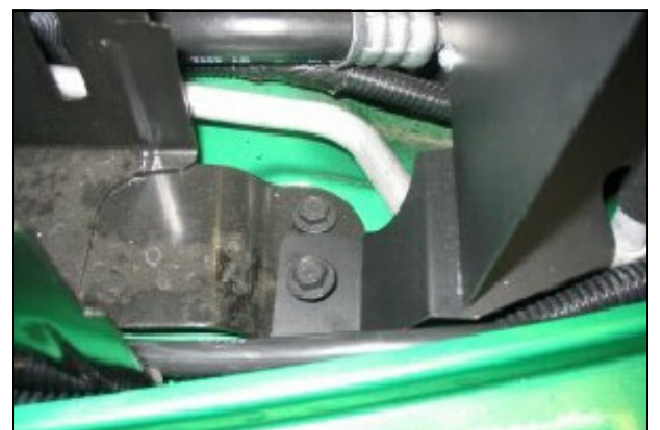
9. Reinstall original bolt through Airaid Cool Air Dam and factory fuse block bracket. Replace fuse block on bracket.