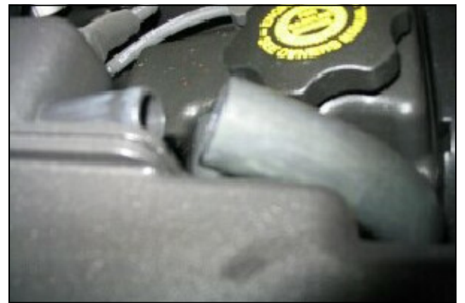
3. Disconnect the breather hose from the factory air box silencer. (Note: Retain hose for later use.)