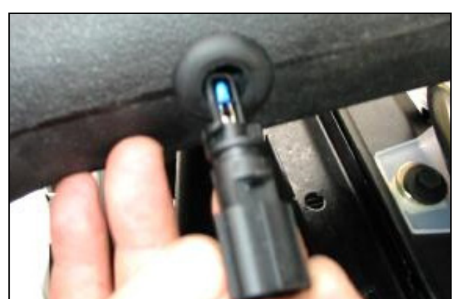
9. 2003-2005 Models Only: Install rubber grommet w/ thru hole and insert the factory air temperature sensor into the grommet.