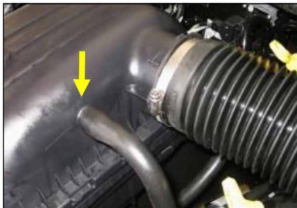
2. 2004-05 Models Only: Disconnect the factory breather hose from the factory air box lid.