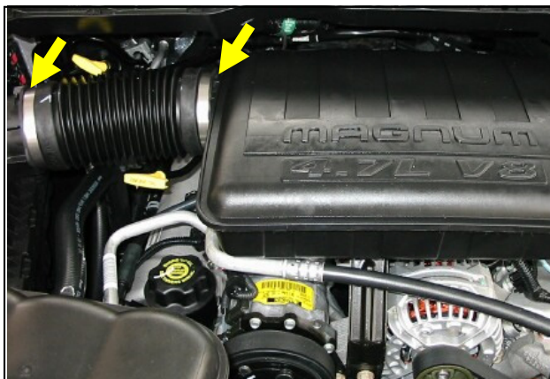
1. Disconnect The Negative Battery Terminal! Loosen the two hose clamps on the factory air tube.