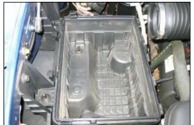
3. Unsnap and remove the factory air box lid, tube, & factory air filter.