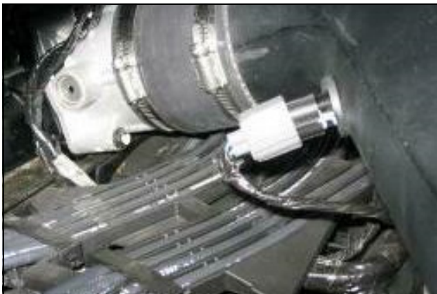
14. Re-connect air temperature sensor connector to the sensor in the Airaid tube.