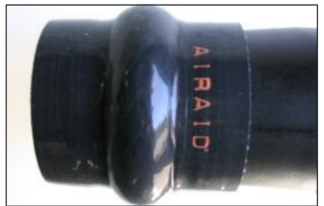
12. Install urethane hump hose onto the Airaid tube and secure using a # 60 hose clamp provided.