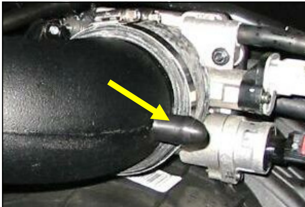
16. 2004-05 Models Only: Slide the provided rubber cap over the nipple at the throttle body end of the Airaid tube.