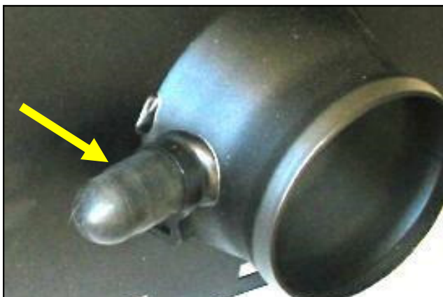
17. 2002 & 2003 Models Only: Slip the black rubber cap over the nipple on the Cool Air Dam and secure using the #19 Speed clamp provided.