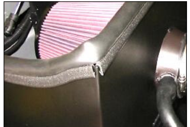
18. 2004-05 Models Only: Connect the factory breather hose to the Airaid Cool Air Dam & secure using the #24 Speed clamp provided.