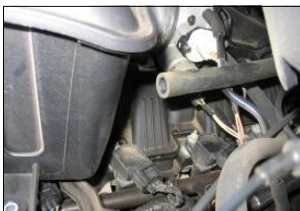
5. 2002 & 2003 Models Only: Disconnect the crankcase vent hose on the back of the factory throttle body air chamber.