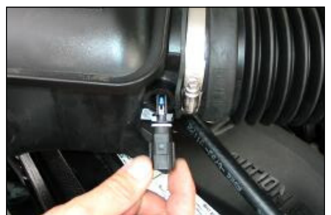
6. 2003-05 Models Only: Disconnect air temperature sensor wire on back of factory throttle body air chamber and remove sensor. Retain sensor for later use with the Airaid Intake System.