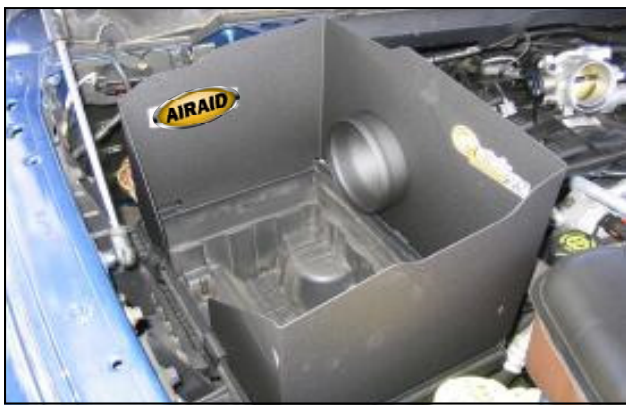
10. Position the Airaid Cool Air Dam in place of the original air box lid. Snap in place.