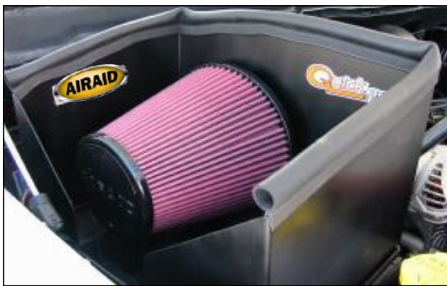
11. Mount the Airaid Premium filter inside the Cool Air Dam & secure with hose clamp provided. In addition, install the weather strip hood seal on the Cool Air Dam. (Hint: begin in a corner and work it on toward the ends)