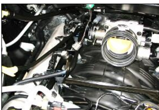
7. Unsnap the factory intake assembly from front of bracket and remove assembly from vehicle. (Note: leave the factory coupler on the throttle body)