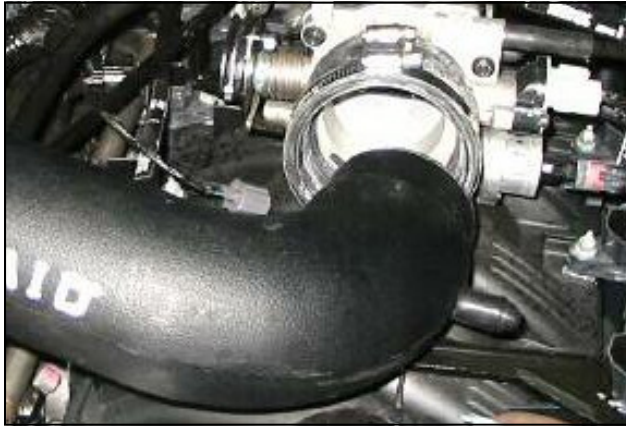
13. Position Airaid tube into place by connecting hump hose to Airaid Cool Air Dam and connect the other end of the tube to the factory throttle body coupler. Utilize the #60 hose clamps on the hump hose and #56 hose clamp on the factory coupler.