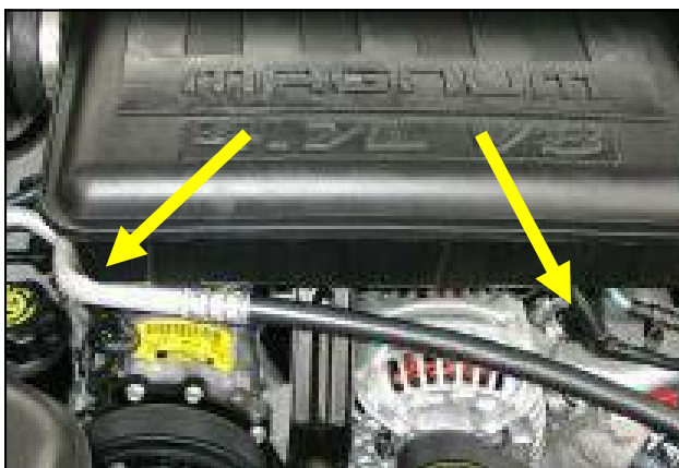
4. Loosen and remove the two 10mm bolts holding on the factory throttle body air chamber intake assembly.