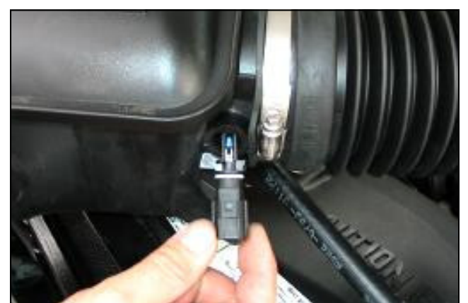
6. 2003-05 Models Only: Disconnect air temperature sensor wire on back of factory throttle body air chamber and remove sensor. Retain sensor for later use with the Airaid Intake System.