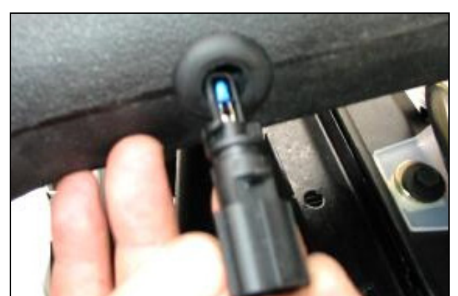
9. 2003-2005 Models Only: Install rubber grommet w/ thru hole and insert the factory air temperature sensor into the grommet.