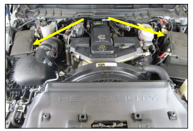
1.Disconnect The Negative Battery Terminals! Warning: Installation of this Intake system requires working in close proximity to the turbocharger. Please allow a sufficient cooling time before beginning the installation to avoid personal injury.