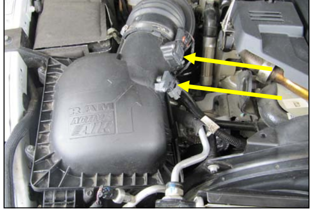
2. Disconnect both of the air sensors in the airbox top.