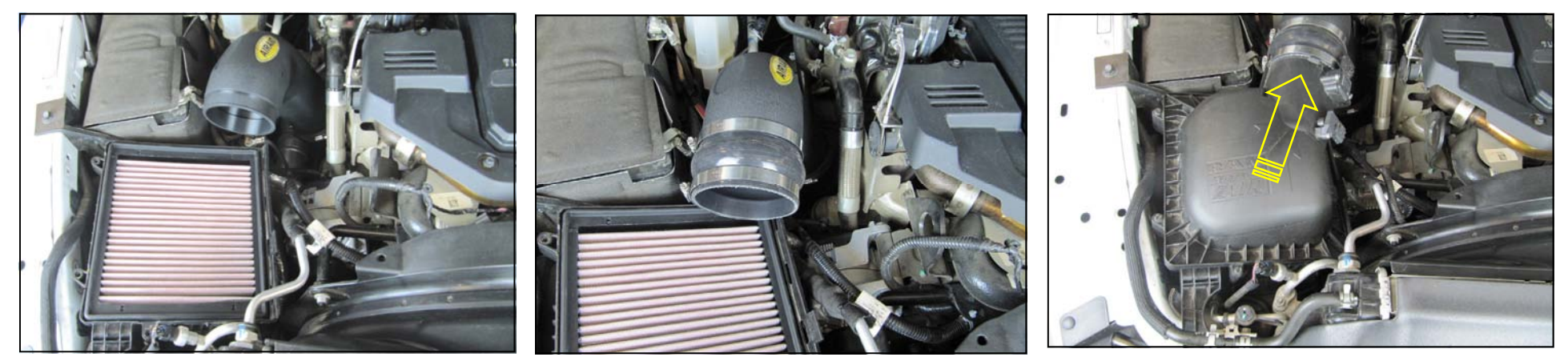
6. If you are installing an Airaid Jr. kit, install the Airaid Premium Filter at this time.

5. Slide the Alfaid intake tube into the turbo inlet but leave the clamp loose for now.