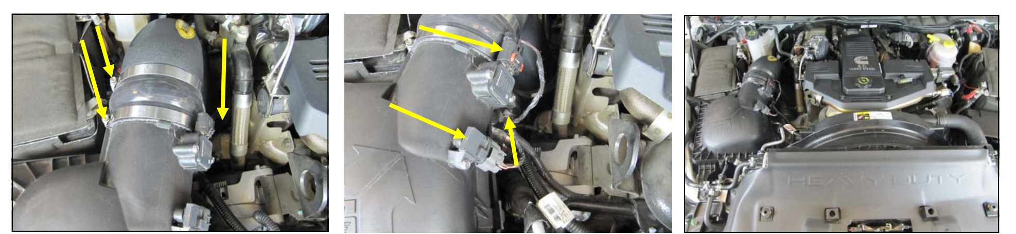
8. Tighten all three Intake Clamps at this time.