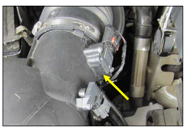
3. Gently pry the harness anchor out of it's tab on the airbox and free the wire harness.