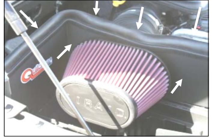
8. Install the Airaid Premium Filter (#1) onto the Quick Fit Panel as shown, and tighten the clamp. Install the weather strip (#3) onto the top of the Quick Fit Panel as shown. (Hint: Start at one end and work towards the other.)