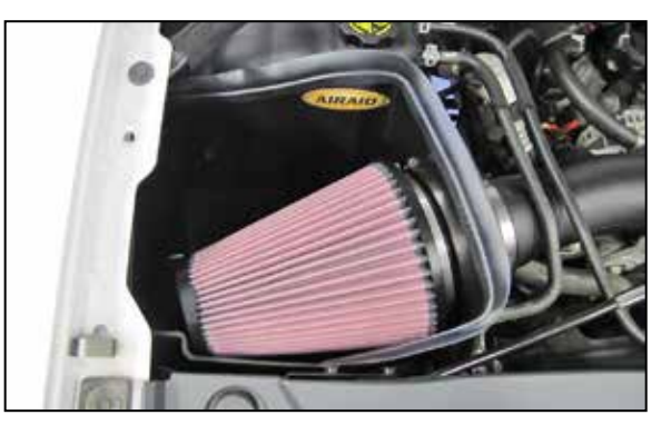
14. Install the weather strip onto the top edge of the AIRAID<sup>®</sup> air box with the contour rolling away from the filter as shown.