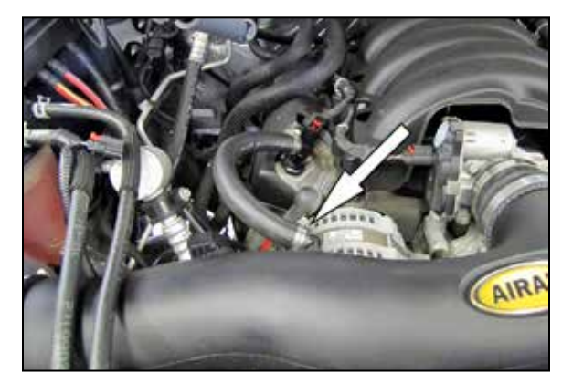
11. Install the provided PCV hose onto the fitting on the valve cover and in the intake tube with the provided hose clamps. Secure the PCV hose with the hose clamps.

10. Install the provided 90° quick disconnect fitting onto the valve cover PCV port.