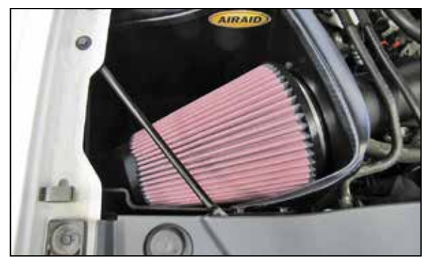
15. Rotate the fender brace back into position and reinstall the factory bolt and tighten the core support bolt.