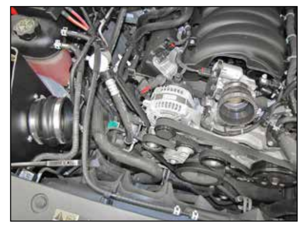
8. Install the hump coupler onto the filter adapter with the #70 hose clamps and the step coupler onto the throttle body with the #52 and #60 hose clamps. Do not tighten the hose clamps at this time.