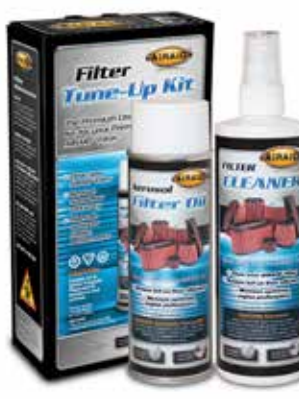
P/N 790-551 Aerosol Spray P/N 790-550 Squeeze Spray