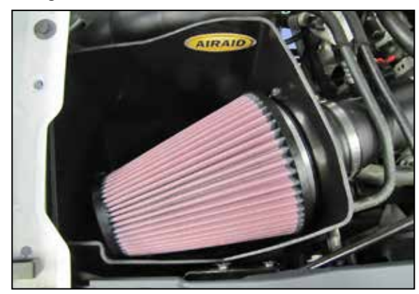
13. Install the AIRAID® air filter onto the filter adapter and secure with the provided hose clamp.