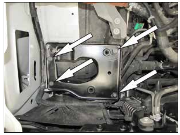
3. Remove the four bolts shown securing the air filter housing tray to the inner fender and then remove the tray from the vehicle. NOTE: Three of these bolts will be reused in a later step.