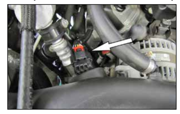
12. Reconnect the mass air sensor and secure the red locking tab.