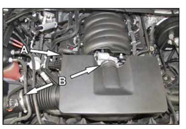
1. Disconnect the negative battery cable! A. Depress the grey locking tab in the PCV breather connector quick disconnect fitting on the valve cover and disconnect the PVC from the valve cover. B. Loosen the hose clamps that secure the intake plenum assembly to the throttle body and air filter housing and then remove the complete assembly from the vehicle.