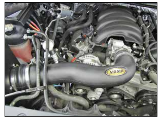
9. Install the AIRAID® intake tube into the hump coupler and then into the step coupler, adjust the tube and couplers for best fit and then secure all the hose clamps.