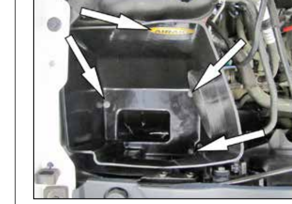
5. <u>Install the AIRAID air box into the vehicle</u> and secure with three of the OEM bolts from step #3. Apply one of the provided AIRAID<sup>®</sup> decals to the air box as shown.