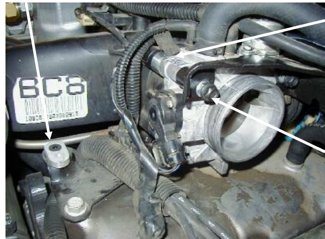
Ref. A - Power Plate "O" Ring

<u>Ref. C</u> - Flat Washer 6mm (Air box Support)