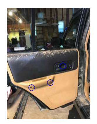
I.REMOVE (3) PHILLIPS SCREWS IN DOOR PANEL.