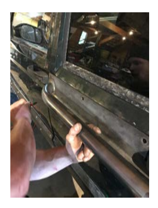
4. HOLD PANEL IN PLACE AND MARK HOLES WITH MARKER