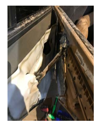
2. UNHOOK DOOR LATCH LINKAGE AND UNPLUG WIRES.3. PEEL BACK PLASTIC DOOR LINER.