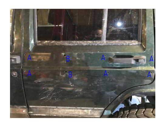
5. DRILL HOLES - 3/8" HOLES FOR BOLTS (A) AND 7/16" HOLES FOR RIVNUTS (B). -BE SURE TO TAKE EXTREME CAUTION ON (B) HOLES BECAUSE WINDDWO GLASS IS DIRECTLY BEHIND HOLES. DRILL BIT CAN NOT PROTRUDE INTO DOOR PAST HOLES.