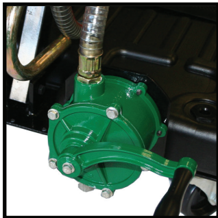
Green pump visually tells it's for antifreeze