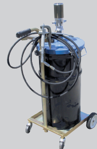
Model 8622A 50:1 Air Operated Grease Pump

Guilderland Center, NY - 1-800-255-0555 - www.affjaxx.com