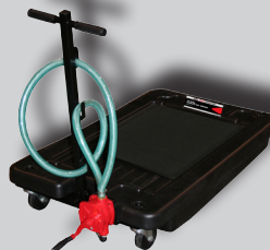
Model 8878 18 Gallon Waste Oil Drain