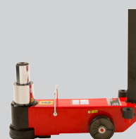
Model 548SD 60/40/20 Ton 3 Stage