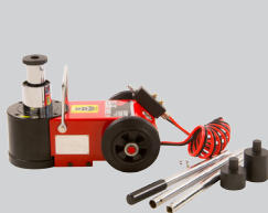
Model 545SD 30/15 Ton 2 Stage