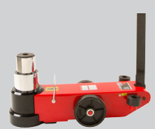
Model 549SD 80/50 Ton 2 Stage