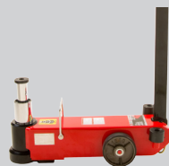
Model 546SD 25/10 Ton 2 Stage