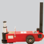
Model 546SD 25/10 Ton 2 Stage