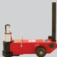
Model 547SD 50/25 Ton 2 Stage