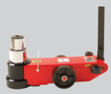
Model 549SD 80/50 Ton 2 Stage

Check out the collection of car jacks we offer.