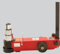
Model 548SD 60/40/20 Ton 3 Stage