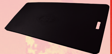
Model 3902 Power Mat

Guilderland Center, NY - 1-800-255-0555 - www.affjaxx.com