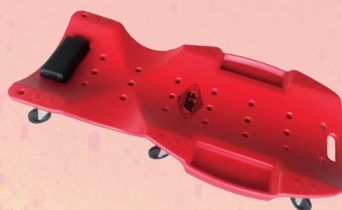
Model 3909 Super Duty Creeper XL