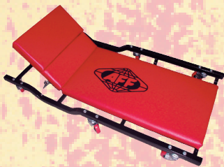
Model 3908 42" Mechanics Creeper