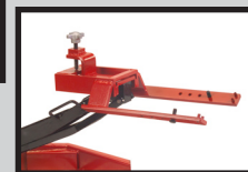
Model 3758 Brake Drum Adapter