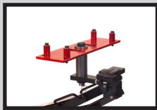
Model 3751 Flywheel Adapter