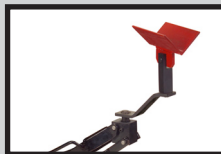
Model 3755 Starter Motor Adapter