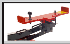
Model 3756 Auxiliary Case Adapter