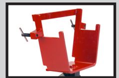
Model 3759 Camelback Spring Adapter