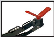
Model 3754 Driveshaft Adapter