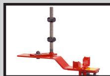
Model 3757 Differential Adapter