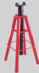
Model 3310A 10 Ton Pin Style Stand

Guilderland Center, NY - 1-800-255-0555 - www.affjaxx.com