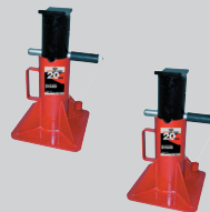
Model 3314 20 Ton Pin Style Stand (sold ea.)