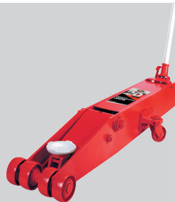
Model 3140 20 Ton Long Chassis Service Jack