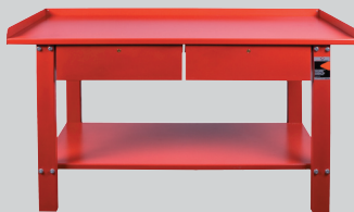
Model 992 2 Drawer Work Bench