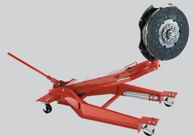
Model 3700 Clutch Jack