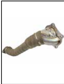
Twisted Steel Downpipe