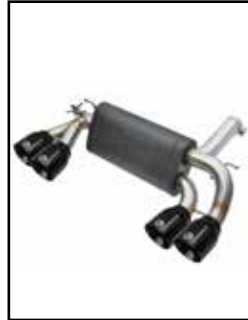
Axle-Back Exhaust System

P/N: 49-36333-B (Blk Tip) 49-36333-P (Pol Tip) 49-36333-C (C/F Tip)