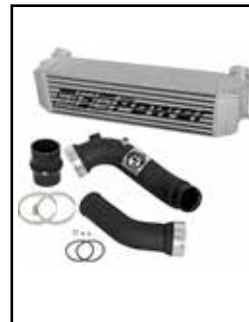
Intercooler w/ Tube

P/N: 54-12208 (Black) 54-12208-L (Blue) 54-12208-R (Red) 54-12208-C (Carbon)