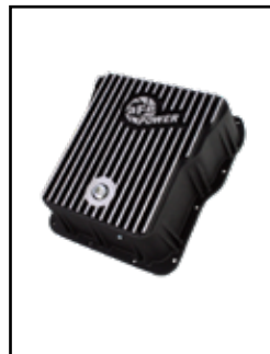
Transmission Pan Cover

P/N: 46-70012-WL (w/ Oil) 46-700012 (Blk) 46-70010 (RAW)