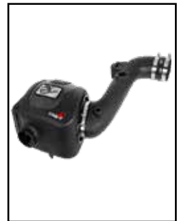
Air Intake System