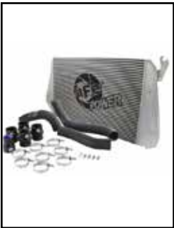
Intercooler w/ Tubes