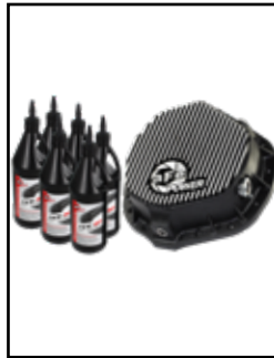
Rear Differential Cover

P/N: 46-70012-WL (w/ Oil) 46-700012 (Blk) 46-70010 (RAW)