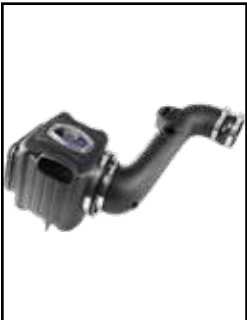
Air Intake System