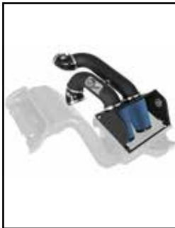
Cold Air Intake System