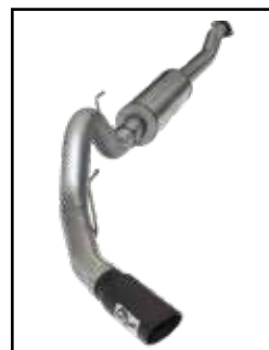
Cat-Back Exhaust System

P/N: 49-43069-B (Blk Tip) 49-43069-P (Pol Tip)