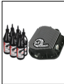
Rear Differential Cover

P/N: 46-70152-WL (w/ Oil) 46-70152 (Blk) 46-70150 (RAW)