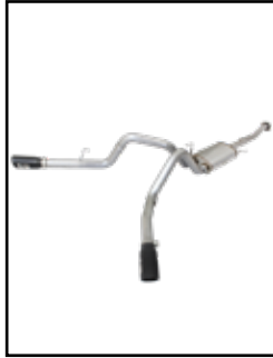
Cat-Back Dual Exhaust System

P/N: 49-43070-B (Blk Tip) 49-43070-P (Pol Tip)