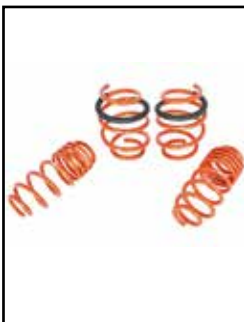
aFe Control Springs

P/N: 48-33024-HC (Street) 48-33024-HN (Race)