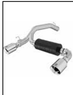
Axle-Back Exhaust System

P/N: 49-33104-P (Pol. Tips) 49-33104-B (Blk. Tips) 49-33104-L (Blue Tips)