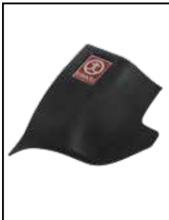
Intake System Cover