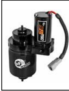
DFS780 PRO Fuel System

P/N: 49-43102-B (Blk. Tips) 49-43102-P (Pol. Tips)