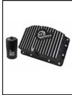
Engine Oil Pan