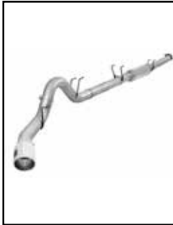
DP-Back Exhaust System

P/N: 49-43093-B (Blk. Tips) 49-43093-P (Pol. Tips)