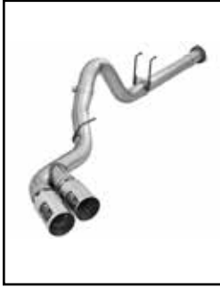
DPF-Back Exhaust System

P/N: 49-43102-B (Blk. Tips) 49-43102-P (Pol. Tips)