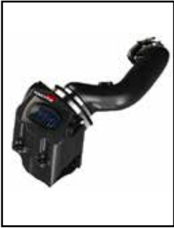
Cold Air Intake System