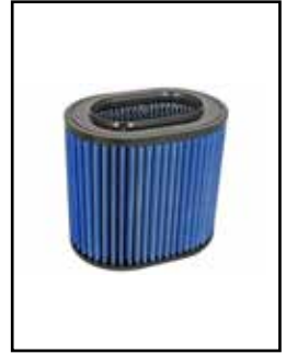
OER Air Filter

P/N: 10-10139 (P5R) 11-10139 (PDS) 71-10139 (PG7)