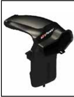
Air Intake System Scoop