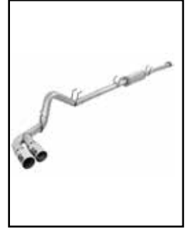
DP-Back Exhaust System

P/N: 49-43096-B (Blk. Tips) 49-43096-P (Pol. Tips)