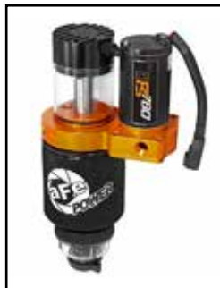
Diesel Fuel System

P/N: 42-12035 (Full-time) 42-12036 (Boost Act.)