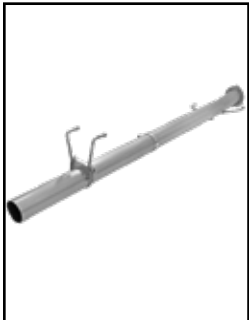
Exhaust Race Pipe

P/N: 50-72005 (P10R) 51-72005 (PDS) 75-72005 (PG7)