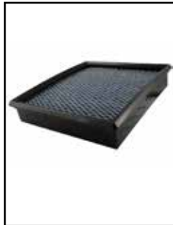
OER Air Filter

P/N: 30-10011 (P5R) 31-10011 (PDS) 73-10011 (PG7)