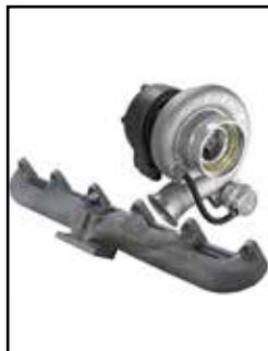
Turbocharger w/ Manifold

P/N: 46-70032-WL (w/ Oil) 46-70032 (Blk) 46-70030 (RAW)