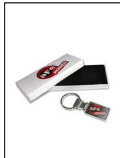
aFe Key Chain