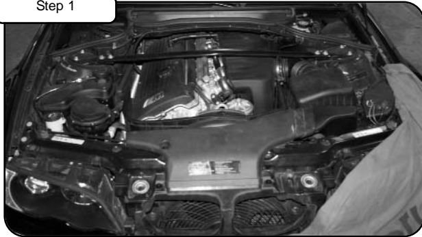
Complete Stock Configuration.