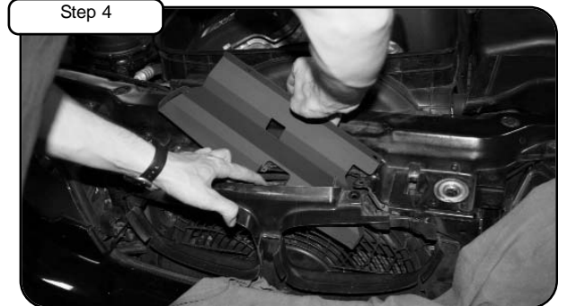
Gently pull grill forward to insert the aFe DAS.