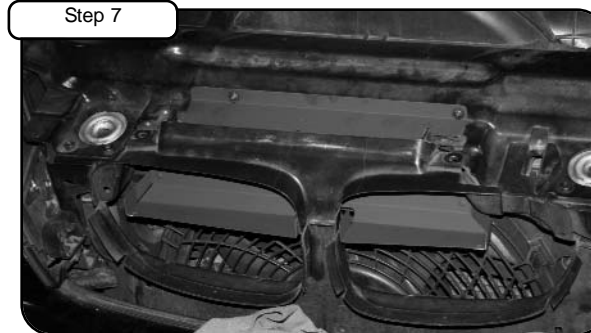
Scoops with screw installed.