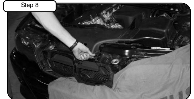
Replace inlet duct and retaining pins and enjoy your aFe DAS.