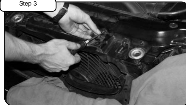
Remove retaining screws. (2)