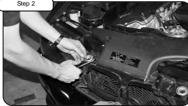
Remove inlet duct retaining pins and inlet duct.