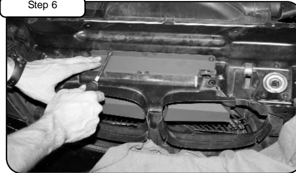
Replace the screws removed in step 3.