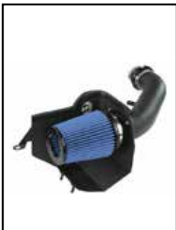
Magnum Force Intake System