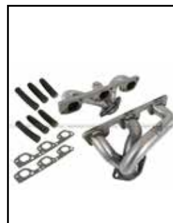
Twisted Steel Headers