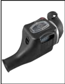
6.0L Intake System