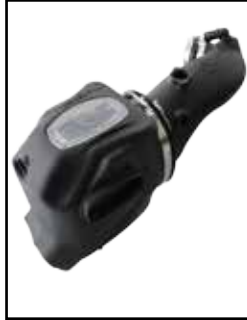
6.4L Intake System

P/N: 50-73004 (P10R) 51-73004 (PDS) 75-73004 (PG7)