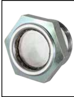
aFe Sight Glass