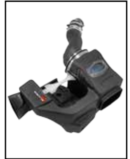
7.3L Intake System