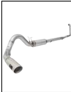
6.0L Exhaust System

P/N: 49-43077-B (Bik Tip) 49-43077-P (Pol Tip)