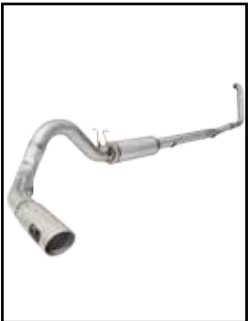
7.3L Exhaust System

P/N: 49-43075-B (Bik Tip) 49-43075-P (Pol Tip)