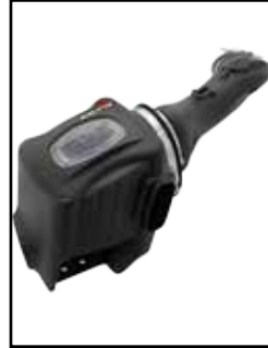
6.7L Intake System

P/N: 50-73004 (P10R) 51-73004 (PDS) 75-73004 (PG7)