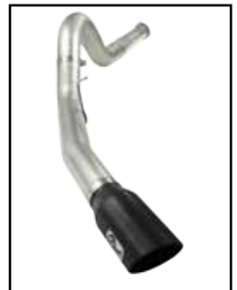
6.7L Exhaust System

P/N: 49-43055-B (Bik Tip) 49-43055-P (Pol Tip)