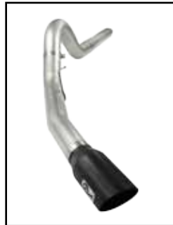
6.4L Exhaust System

P/N: 49-43054-B (Bik Tip) 49-43054-P (Pol Tip)