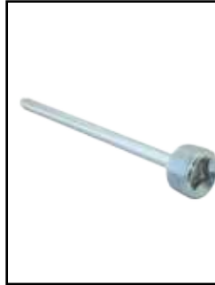
aFe Magnetic Fill Plug