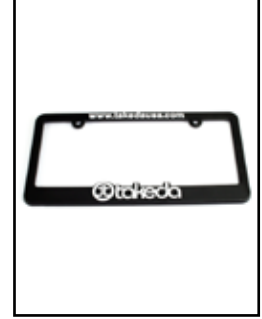
Lic. Plate Frame

P/N: 40-30332 M P/N: 40-30333 L P/N: 40-30334 XL