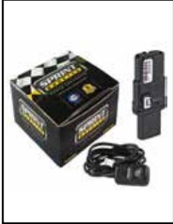
Sprint Booster V3

P/N: 49-36023-P (Pol Tips) 49-36023-B (Blk Tips)