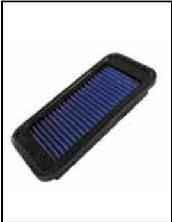
OE Replacement Filter