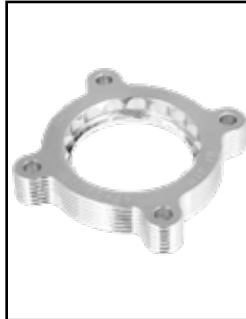
Throttle Body Spacer