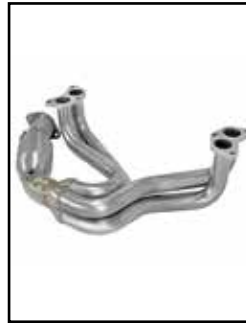
Twisted Steel Header

P/N: 48-36005-HC (Street) 48-36005-HN (Race)