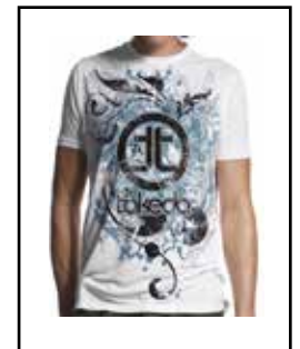
P/N: TP-7004T M P/N: TP-7005T L P/N: TP-7006T XL P/N: TP-7007T 2XL