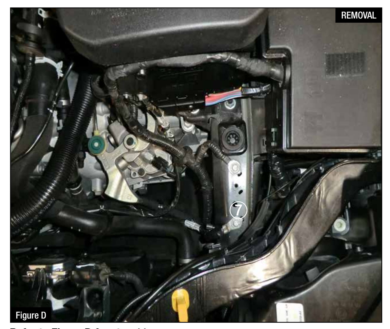
Refer to Figure D for step 11

Step 11: Remove the bolt (7) to the ground wires and replace with the M8 isolation mount.